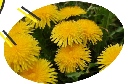
are made for this