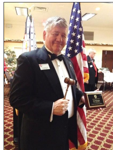
PRES. OF SMC MOAA