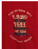
Blankets for the Veterans at VA Hospital